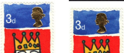
Fig. 3 – Examples of different positions in the printing of the Queen's head.