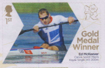
Above: Fig. 2 Ed McKeever Stamp issued Sunday 12 August 2012.

Ed McKeever Saturday 11 August 2012 Eton Dorney